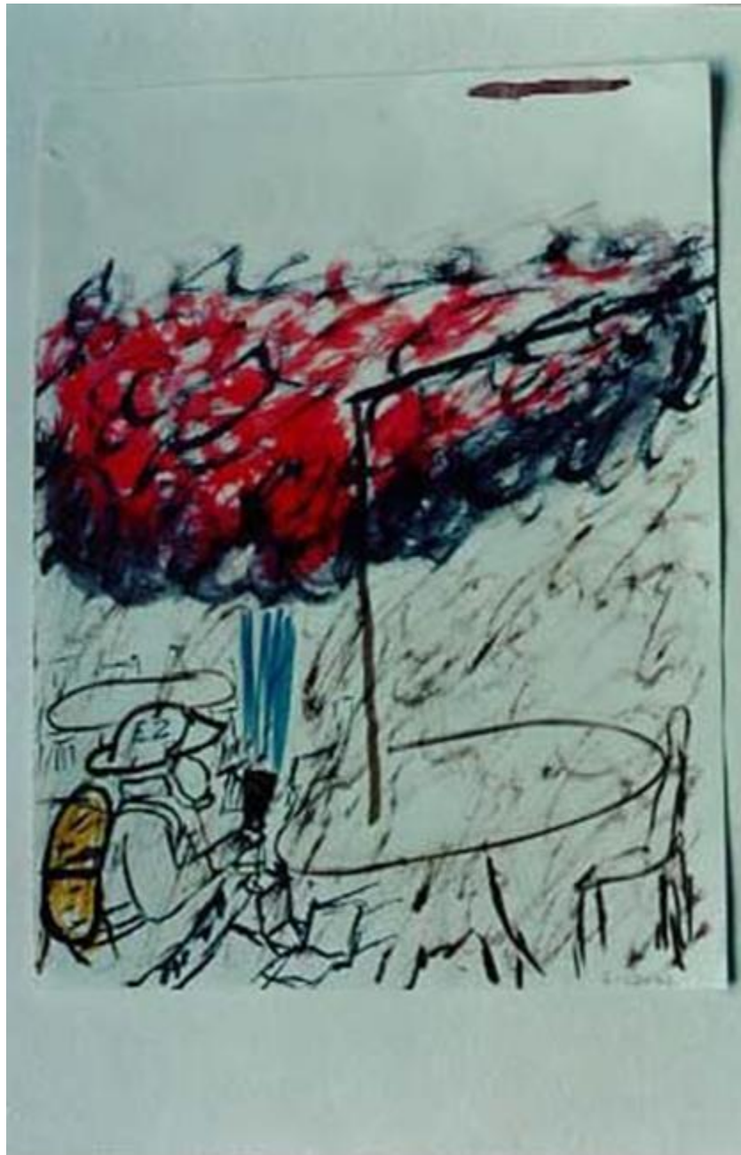
Figure 3. Helpful Characters in the Fantasy Kingdom

triangles can be used. You can also make a 3-D Play Doh or paper mache sculpture of a guardian spirit or a protective character (see Figure 5).