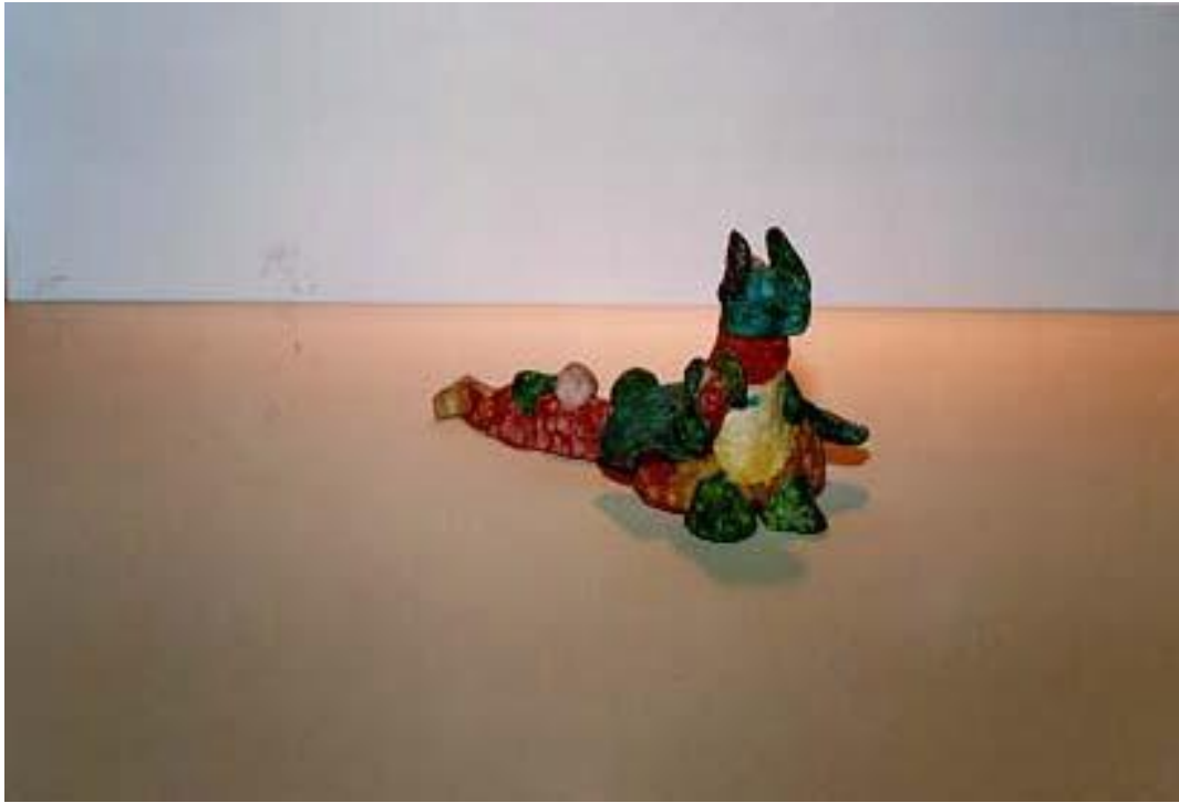
Figure 5. 3-D Guardian Spirit or Protective Figure

be put in about ideas they have had about the disaster. Another section could include ways the world is being put back together in a positive direction. For instance, how people help each other and ideas that your child might have for ways that they can help their family or others. Another section of the art journal could be called “wishes”. This could include drawings or lists of wishes that the child has for himself or herself, for the family, or for other people that your child has heard about or knows. Another section could be maps or safety routes of the house, of ways to stay safe and of plans that can be made to stay safe in situations such as a disaster.