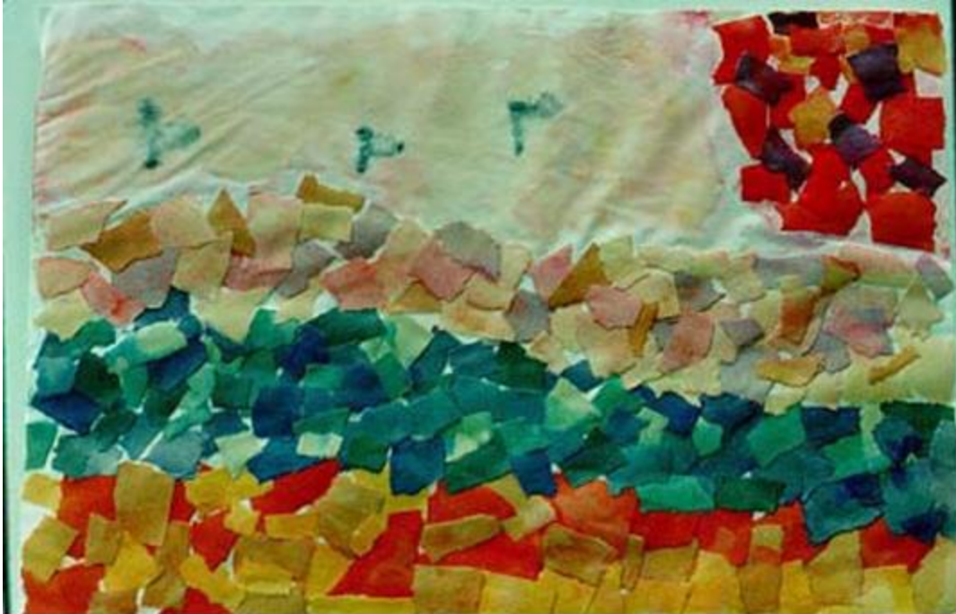
Figure 4. Making a Picture by Tearing Up and Gluing Pieces of Paper