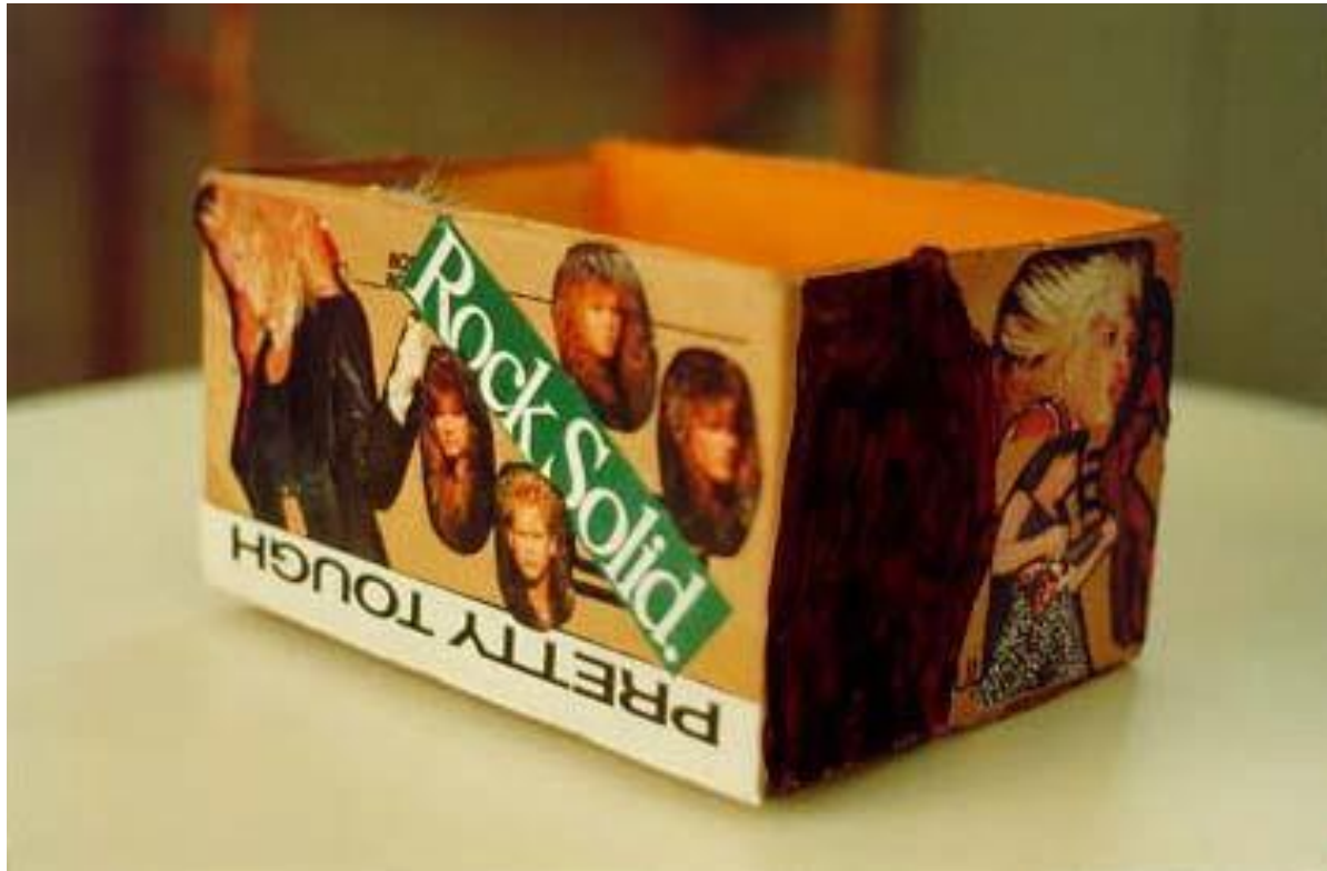
Figure 1. The "Me Box"

Another aspect of this "Me Box" is to go on a treasure hunt to find things on the inside of the house and the outside of the house to add to the box. Photographs, pieces of fabric, or special trinkets that are particularly important to the child, may be put in the inside of the box. Things that you find on the outside of the house that are particular treasures in the garden or on the street and that may reflect ways the world around the child have changed may be added to the outside of the box. In this way your child creates what we call a "Me Box" that completely projects who your child is in his or her world.