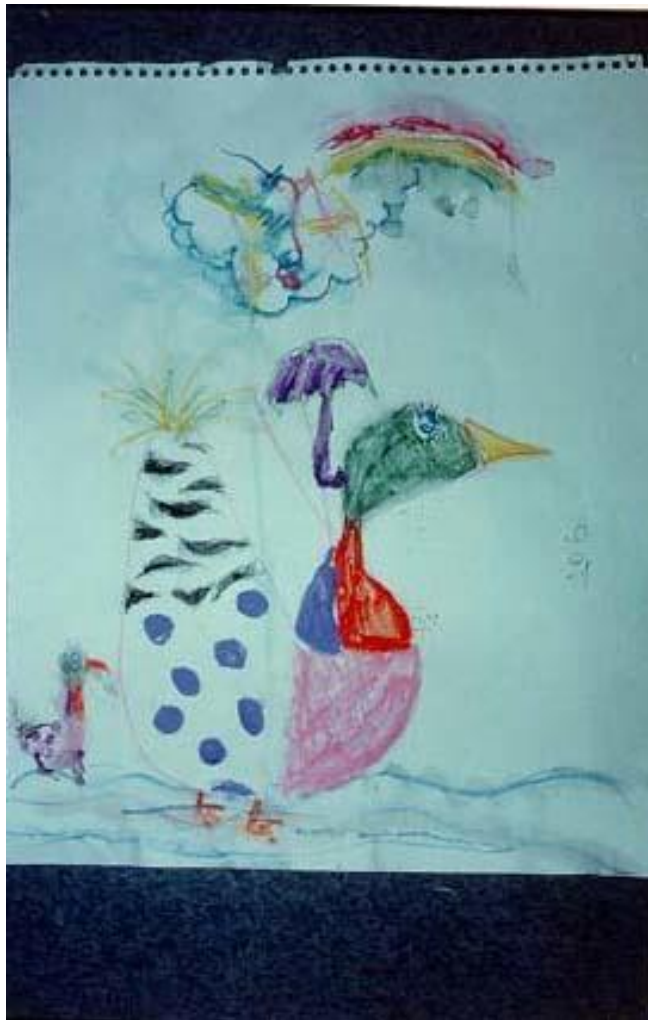
Figure 2. A Once Upon a Time Fairy Tale Drawing or Painting

kingdom where there was a hurricane (flood, earthquake, etc.)” and then let your child fill in the rest of the story by drawing or painting images of what your child thinks happened in this kingdom. Encourage your child to put animals and imagined or real characters in the drawing or painting.